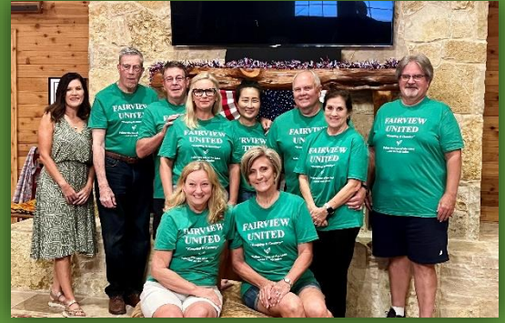
Fairview United working to protect Fairview.

The LDS leadership has asked stakes from