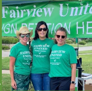
Fairview United volunteers at a petition-signing event.

The physical petition is admissible in court and shows Fairview residents' support for the Town Council in upholding all existing zoning regulations, ordinances, and precedents. Only Fairview residents 18 years and over may sign this petition. Residents are required to list their complete address so that their signatures can be verified. If you haven't signed the the physical petition yet, please check the Fairview United website for the dates