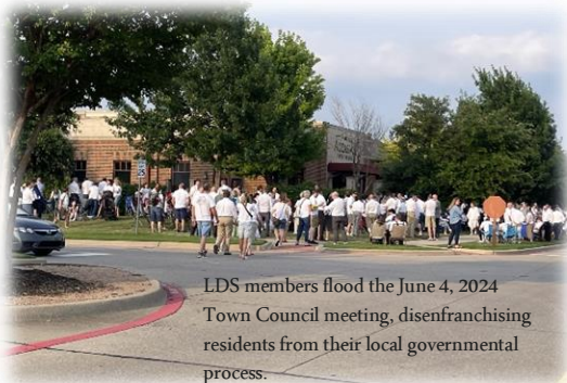
LDS members flood the June 4, 2024 Town Council meeting, disenfranchising residents from their local governmental process.

The LDS was given a continuance on June 4, 2024, in a good faith attempt to provide them with time to modify their building plans to meet Fairview's residential codes and ordinances. On July 11, 2024, the LDS met with Mayor Lessner and Mayor Pro Tem Hubbard. The LDS offered to change the temple name and reduce the height of by approximately 15'. Fairview refused the offer because it still didn't come close to meeting Fairview's residential codes, ordinances and precedents. The CUP will go before the Town Council for approval or denial on August 6, 2024.