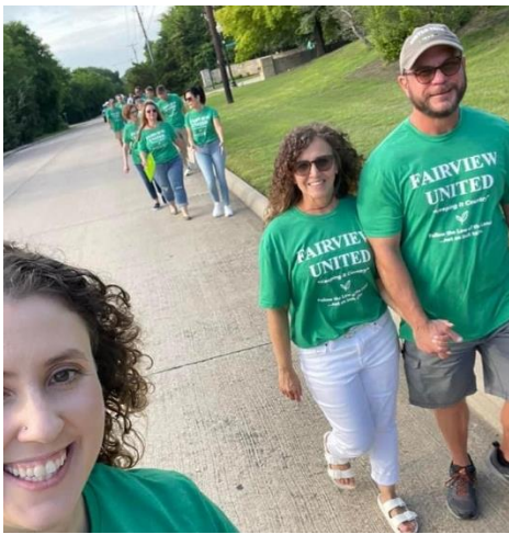
Fairview United on their way to the May 2 open house.

For more information go to www.fairviewunited.net